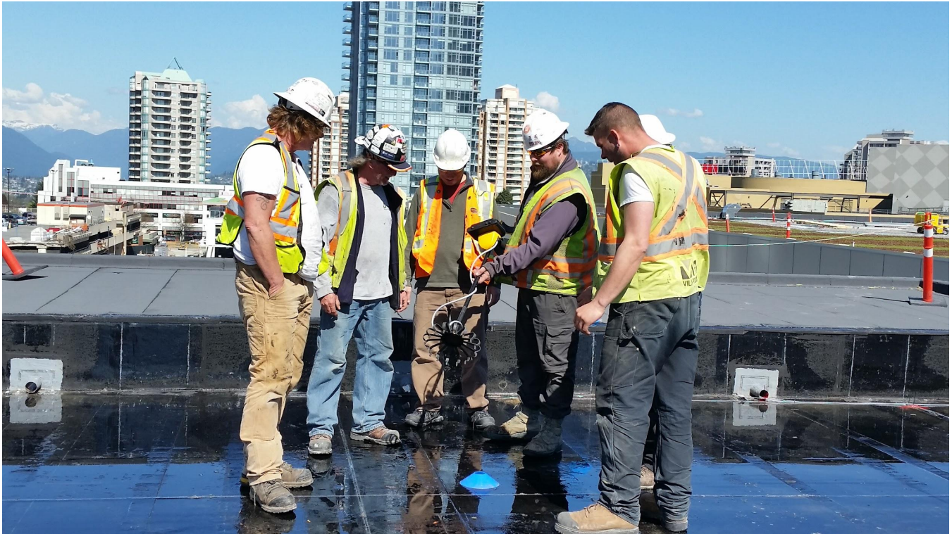
Above: An SMT Technician provides training with a Digiscan 360.

Call SMT or visit digiscan360.com to learn more.