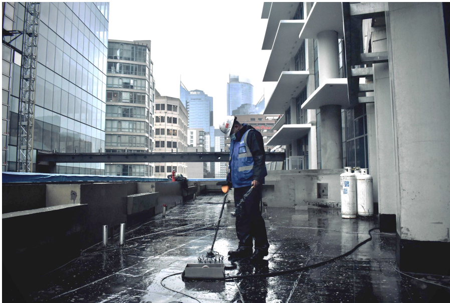
Above: An SMT Technician performs a Digiscan service on an inverted roof membrane

This document gives an overview of SMT's Digiscan service, how the technology works, and what Digiscan can do for you.