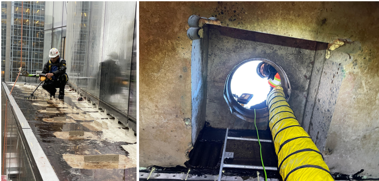
Above Left: SMT Technician uses a harness to scan a high-up ledge.

The flexible design of the Digiscan 360 tool allows scanning of areas that other leak detection tools cannot reach. SMT's operations manager will coordinate with the General Contractor to ensure any lifts/harnesses/other safety equipment are available and that our technicians are fully trained to operate in the area.